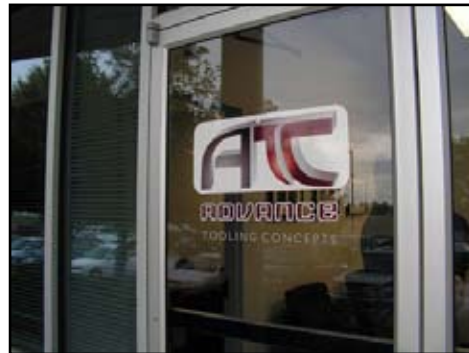
Advance Tooling Concepts expanded its operations in 2010 and held an open house showcasing their new space.